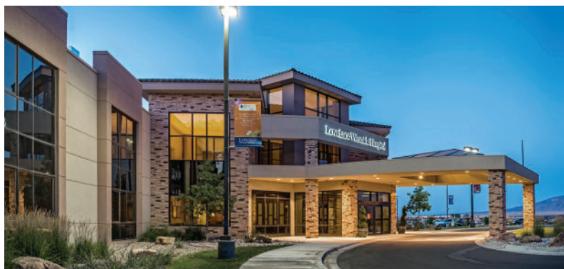
Lovelace Westside Hospital

Lovelace Westside Hospital is a 92-bed acute care facility that includes a 24-hour emergency department where patients typically see a provider in 30 minutes or less.