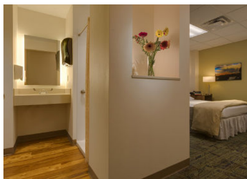
Lovelace Westside Hospital Sleep Center