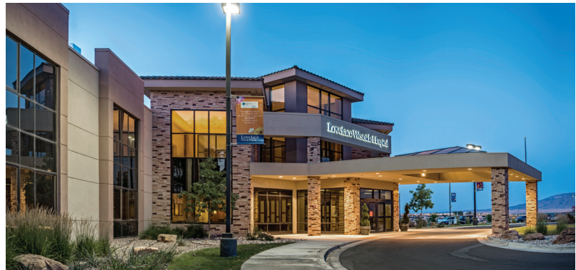
Lovelace Westside Hospital

Lovelace Westside Hospital is a 92-bed acute care facility that includes a 24-hour emergency department where patients typically see a provider in 30 minutes or less.