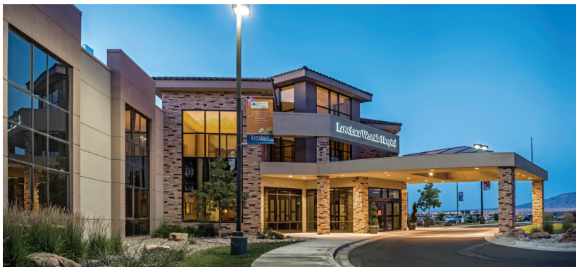
Lovelace Westside Hospital

For over 30 years, Lovelace Westside Hospital has been committed to offering Rio Rancho and Westside residents the highest quality care.