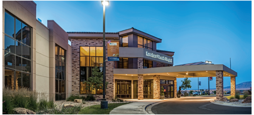
Lovelace Westside Hospital

For over 30 years, Lovelace Westside Hospital has been committed to offering Rio Rancho and Westside residents the highest quality care.