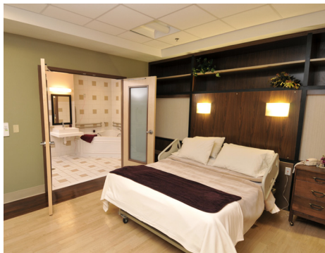
Family Care Unit