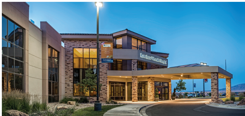
Lovelace Westside Hospital

Lovelace Westside Hospital is celebrating 40 years of serving Rio Rancho and Westside residents of Albuquerque high quality, convenient care.