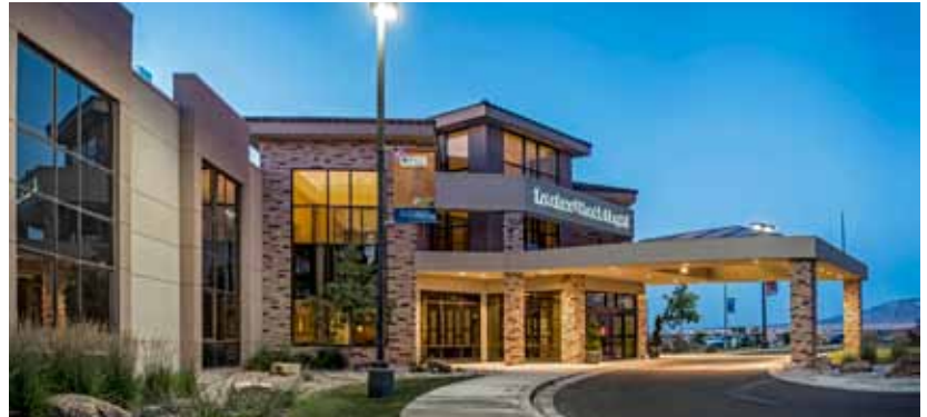
Lovelace Westside Hospital offers the only Inpatient Pediatric Unit servicing Rio Rancho and Westside Albuquerque.

For 29 years, Lovelace Westside Hospital has been committed to offering Rio Rancho and Westside residents the latest in technology and high-quality care. Our 24-hour emergency department offers patients the ability to see a provider in about 30 minutes or less and also includes four dedicated private rooms for children and their families.