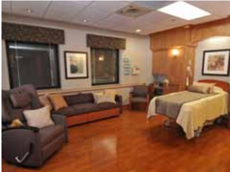
Birthing Center Suite