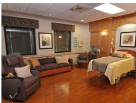
Birthing Center suite