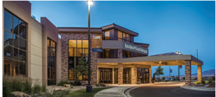
Lovelace Westside Hospital offers the only inpatient pediatric unit servicing Rio Rancho and Westside Albuquerque.

For over 30 years, Lovelace Westside Hospital has been committed to offering Rio Rancho and Westside residents the latest in technology and high-quality care. Our 24-hour emergency department offers patients the ability to see a provider in about 30 minutes or less and also includes dedicated private rooms for our senior patients and for children.