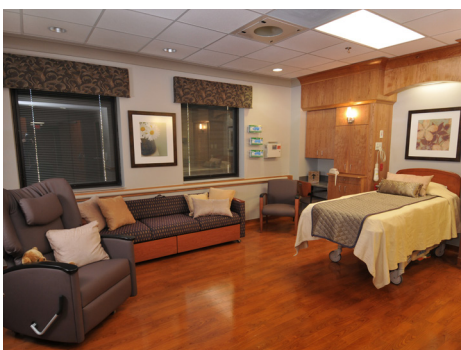
Birthing Center suite