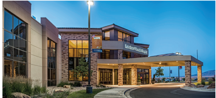
Lovelace Westside Hospital offers the only inpatient pediatric unit servicing Rio Rancho and Westside Albuquerque.

For over 30 years, Lovelace Westside Hospital has been committed to offering Rio Rancho and Westside residents the highest quality care.