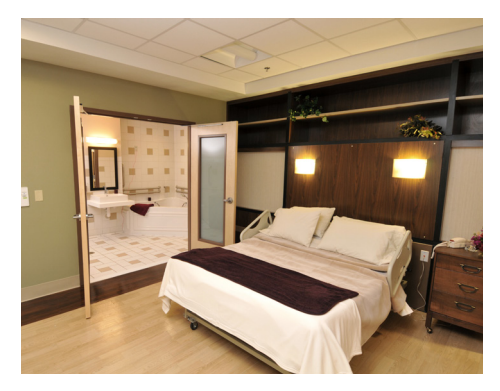
Family Care Unit